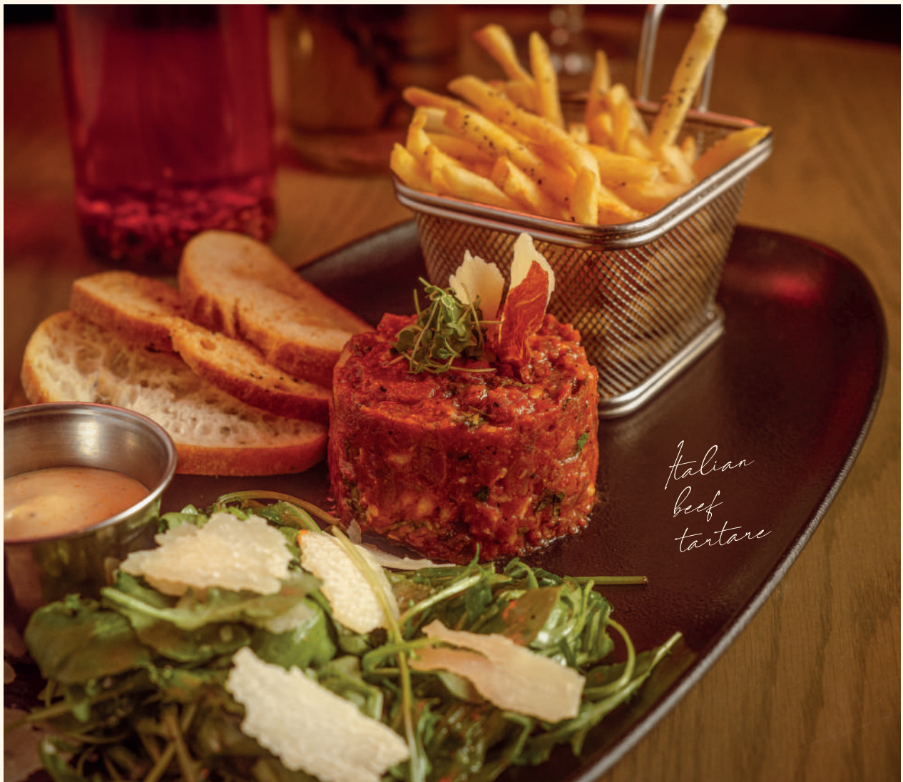
Italian beef tartare